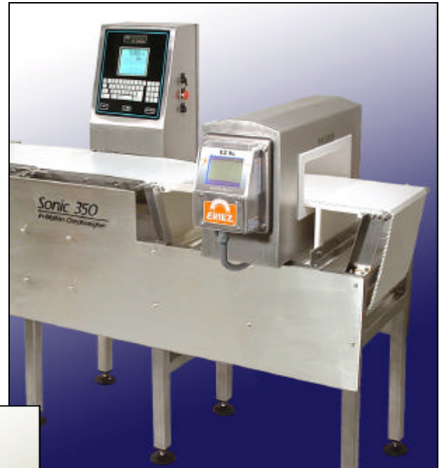
Shown with optional Eriez DSP metal detector